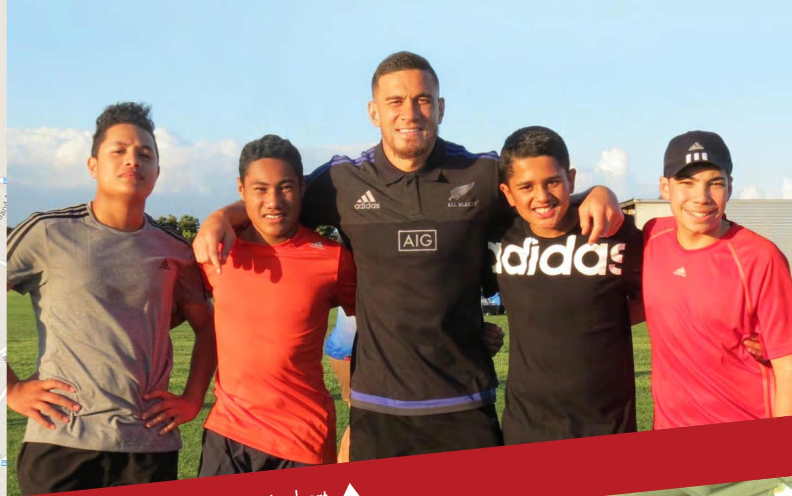
▼ All Black/Adidas TV advert ▲